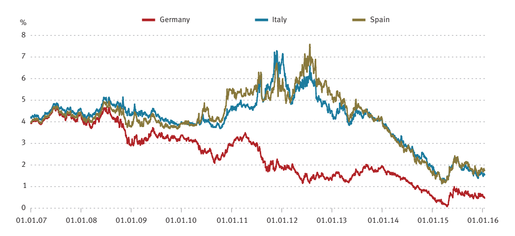
Figure 2: 10-Year Sovereign Bond Yields